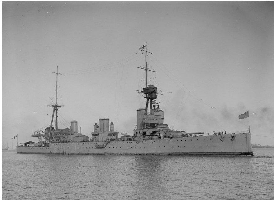
H.M.A.S. Australia 1914