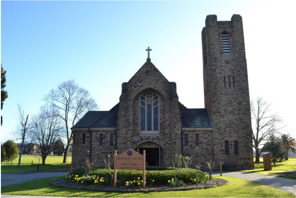
HMAS Cerberus Protestant Chapel of St Mark, Crib Point, Victoria